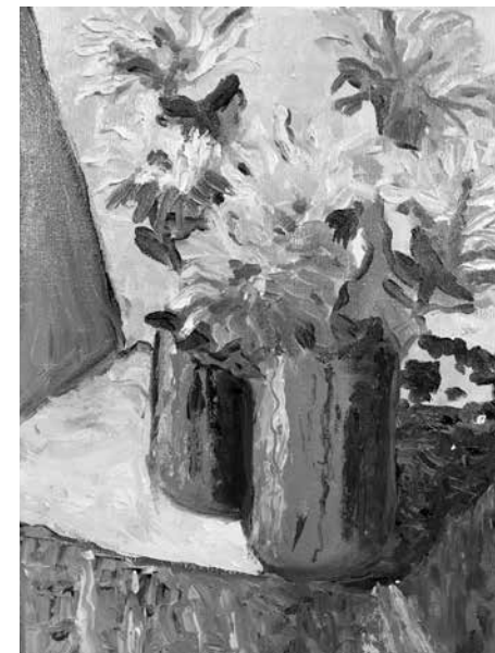
OIL PAINTING, STUDENT WORK

Explore the basic nature of working with oil paints. This class will focus on managing the use of oil paints and brushes, techniques, color use and composition. Fee: $150 (4 sessions)