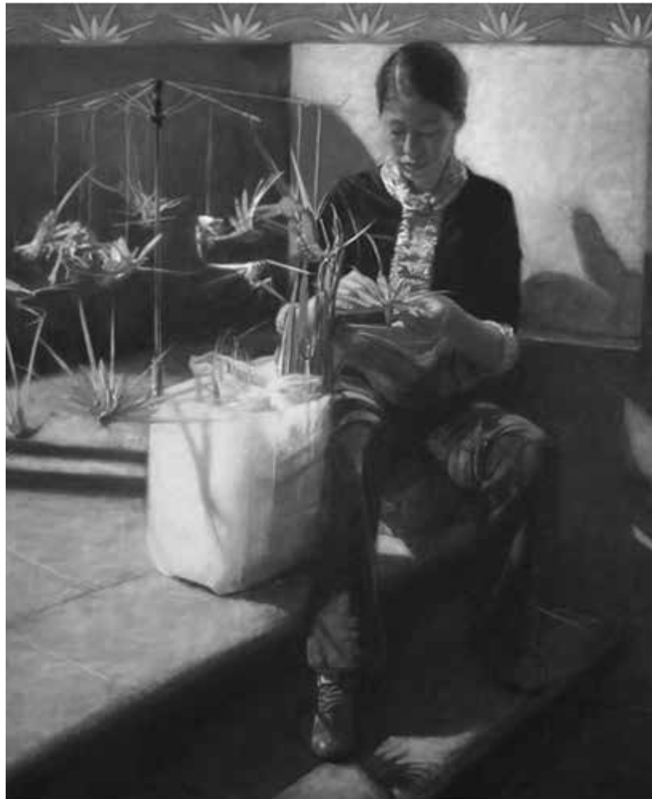
PASTEL BY CAROLYN ROBLES

Learn to use the chisel pen to produce two calligraphic hands (styles) that either separately or together will enable you to letter beautiful cards, posters, poems, and bookmarkers for yourself or others. Fee: $125 (3 sessions)