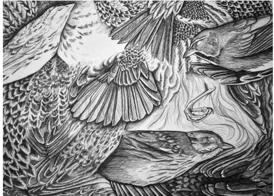
GRAPHITE DRAWING BY SARAIYA KANNING

Drawing is not a precursor to painting. Drawing is a stand-alone act of revelation. Abstract Drawing: From Self to Self is a series of classes that have the capacity for visionary experience. An unexpected occurrence no prior formality will have been able to precede or perform. TOPICS EXPLORED: Spontaneity and Structure, Methods and Materials, Form, Forming Itself Non-Conformingly, Ambiguity and Meaning, Purpose without, Purpose, Provocative Reworking, and Drawing Blind: Empowering Emptiness. Fee: $195 (6 sessions)