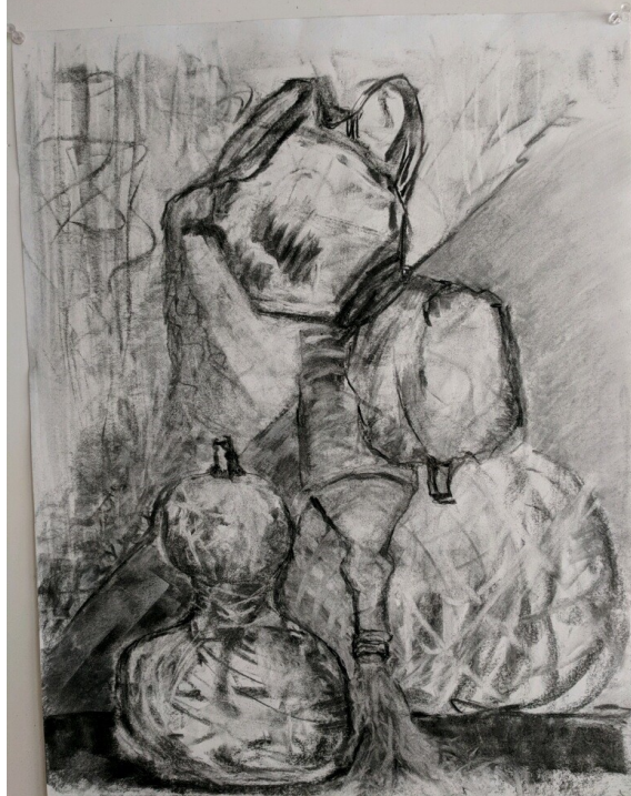
Expressive Charcoal by Brenna Lacey

Please send images of artworks to be considered to jessica@thedrawingstudio.org