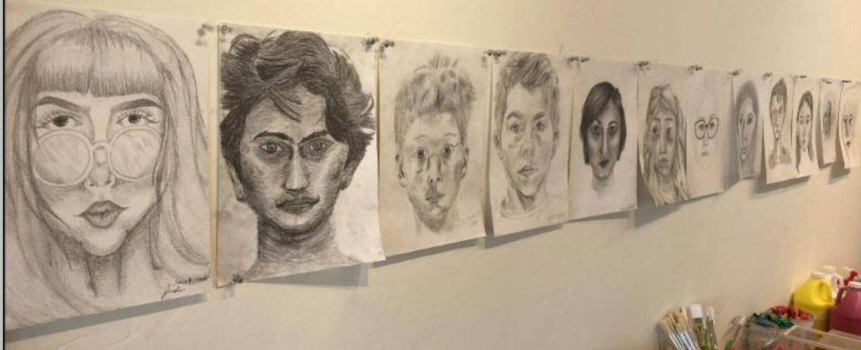
Above: Teen Immersion Self Portraits from Week One

We are wrapping up the third week of Art of Summer camp, and the students have been busy making masterpieces. From beginners to returning artists, The Drawing Studio is filled with young artistic energy.