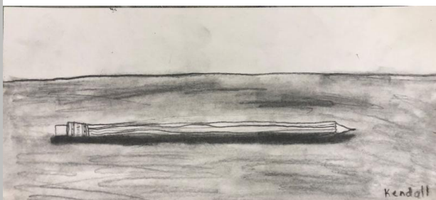
Above: Junior Immersion pencil drawing in graphite Right: Teen Immersion Fruit painting using oil pastel

We are wrapping up the third week of Art of Summer camp, and the students have been busy making masterpieces. From beginners to returning artists, The Drawing Studio is filled with young artistic energy.