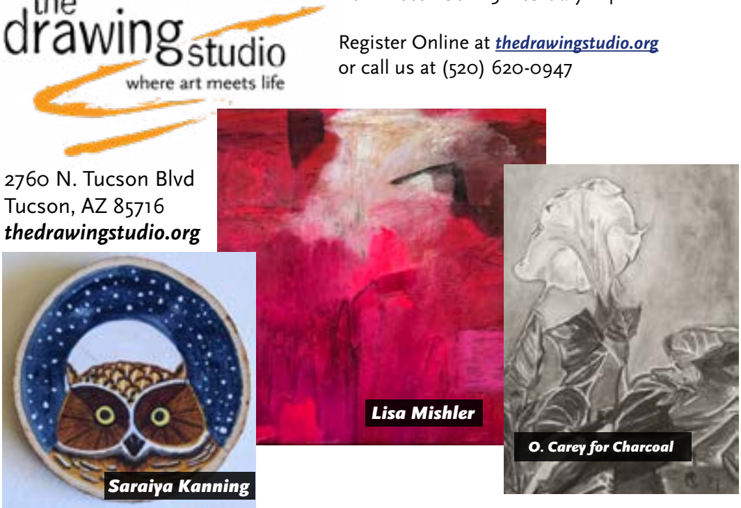
The Drawing Studio is a Non-Profit Community Arts Center Since 1992

Register Online at thedrawingstudio.org or call us at (520) 620-0947