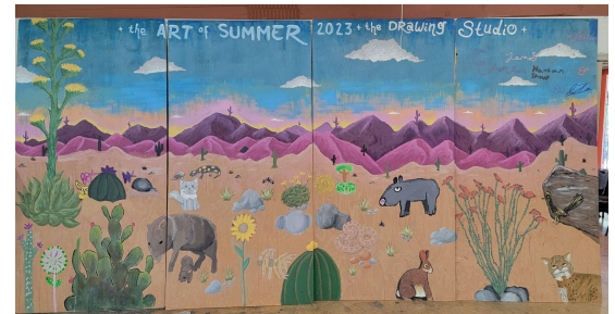
Desert Mural from Art of Summer

He doesn’t just mentor other kids, though - he’s also become somewhat of a design consultant to his parents.